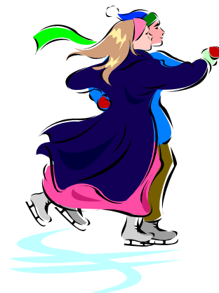
Together we can go far.

If you need prayer cards, I have a ring of laminated cards with prayers on each one. It is color coded for each grade.