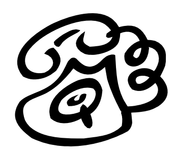
Do you talk to Jesus daily? I bet He would like to hear from you.

Trust me, I know none of you want to teach at home so talk with another parent to see if you can team teach (this would be where you take turns teaching each Wednesday night). If we all pull together, we can make this next year a success for all the kids. Call me if you have questions about teaching.